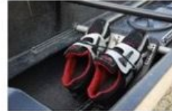
FOOTPLATE & BOLTS