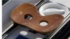
SEAT & HATCH COVER